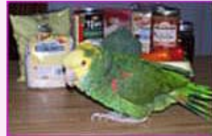
Pumpkin Logs By Toni Fortin

Weekly MINI AUCTIONS!! Bid for the Birds!